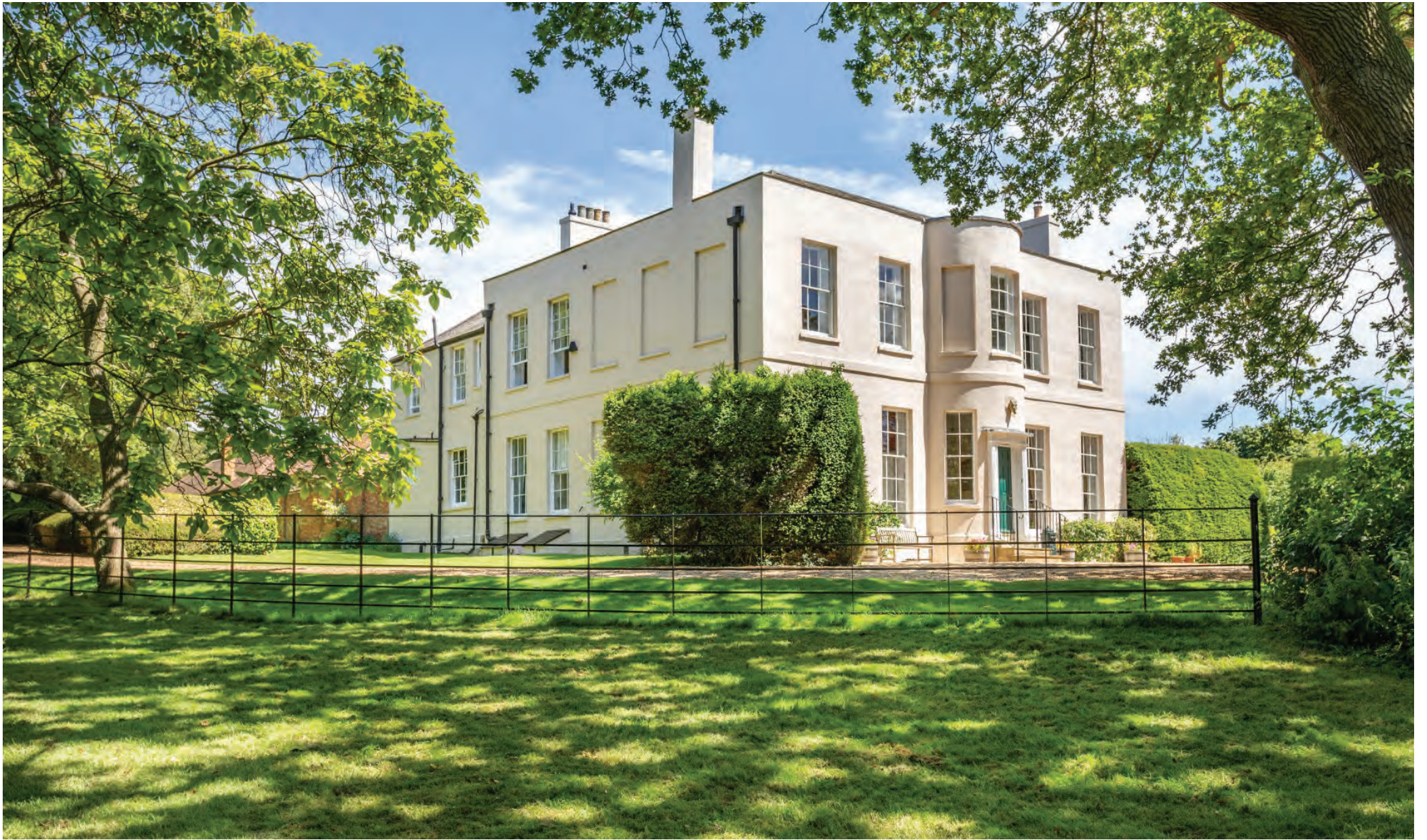
The Old Rectory North Crawley | Newport Pagnell | Buckinghamshire | MK16 9HJ